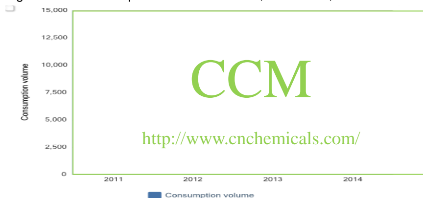
Figure 4.1-1 Consumption of niacin in China, 2011-2014, tonne