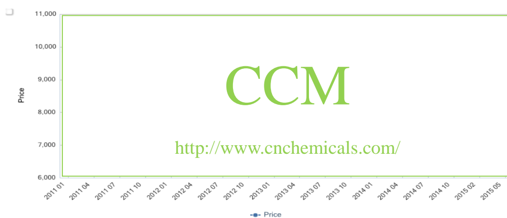
Figure 3.3-1 Market price of niacinamide (feed grade) in China, 2011-H1 2015, USD/t