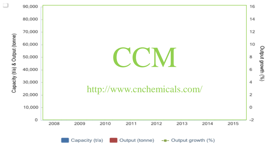
Figure 3.1-1 Capacity and output of niacin in China, 2008-H1 2015